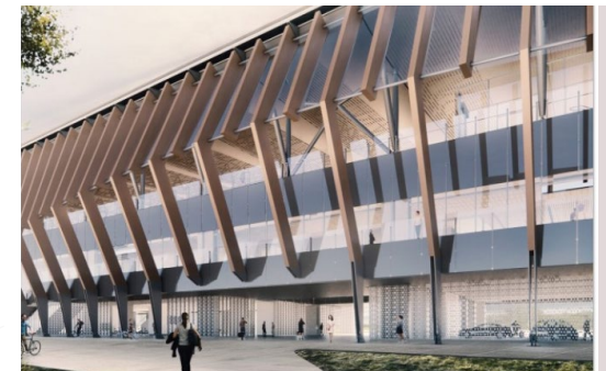
Riga International Airport Hub (Rail Baltica)