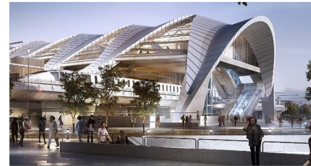
Riga Central Train Station (Rail Baltica)

Riga Airport handled more than 7.8 million passengers in 2019.