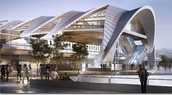
Riga Central Train Station (Rail Baltica)

Riga Airport handled more than 7.8 million passengers in 2019.